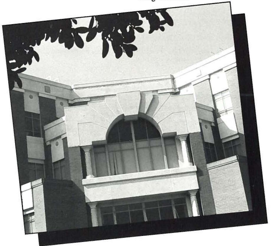
Kaprielian Hall houses the Foundation's new office.

The Slurry Pipeline System is used to study the potential effectiveness of a closed conduit transportation system for coal slurry. This system was constructed to conduct research for the Taiwan Power Company. Construction and testing costs are covered by a grant from the Taiwan Power Company. The slurry system has been operational since early summer and now valuable data is being collected.